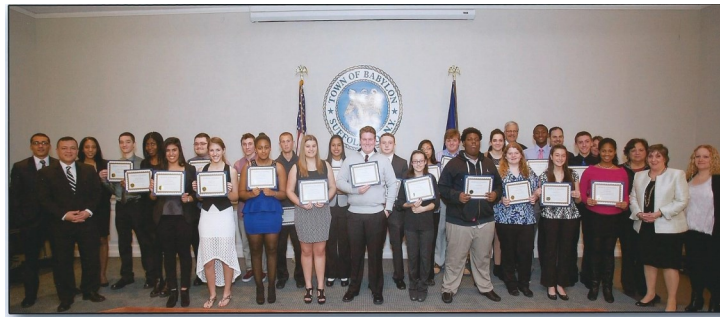
The twenty-eight new members joined the thirty veteran members of the Youth Court on February 4th for their first Youth Court trials.